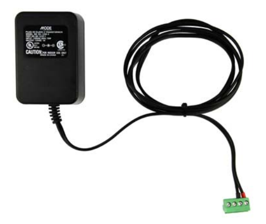
Figure 1: Adaptor with Phoenix connector